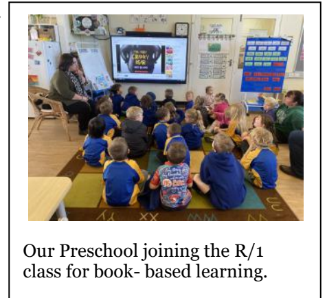
Our Preschool joining the R/1 class for book- based learning.

Please try and ensure your child is wearing school uniform. Wearing school uniform promotes pride in the school and creates a sense of identity. Our uniforms are affordable and available at our front office. Please make sure the shorts or pants that your child is wearing are plain blue or black and are a suitable length. Children should also wear appropriate footwear to school to enable them to participate in physical activities and ensure the safety of their feet. School hats are also required. Please come into the office if you have any uniform questions.