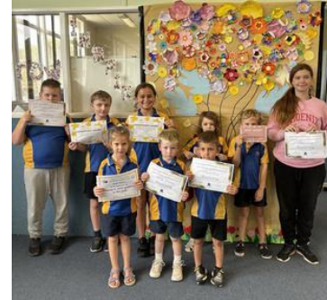
Week 7 Assembly award winners